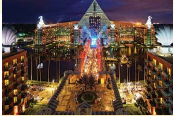
Walt Disney World Swan and Dolphin Hotel.

significant change for the hotel, but absolutely the right evolution of this property.”