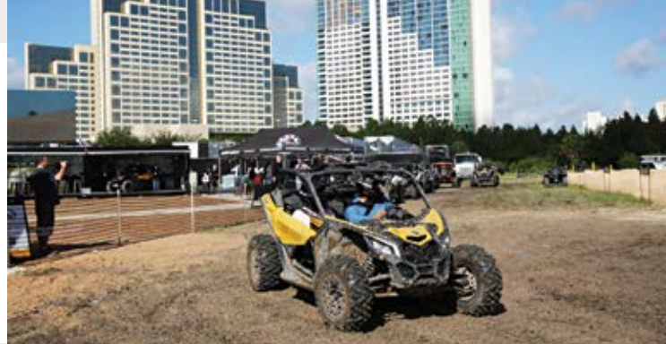
The outdoor demo for Bombardier Recreational Products.