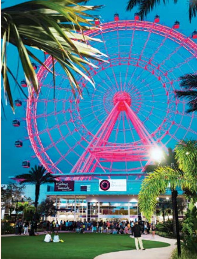
The Coca-Cola Orlando Eye.

enhances the overall experience. For instance, instead of hosting a traditional banquet in a hotel ballroom, planners can take their group into a theme park one evening,