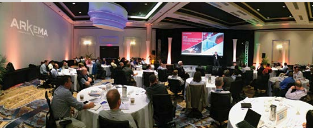
The Arkema meeting, held in October at the Wyndham Grand Orlando Resort Bonnet Creek.