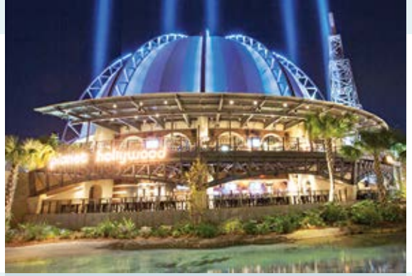
The Planet Hollywood Observatory is now open.

dividual rooms with their own bar (and separate sound system) for 150 to 300 guests reception-style, up to taking the entire second floor, which can accommodate 350 seated or 1,000 for a reception.