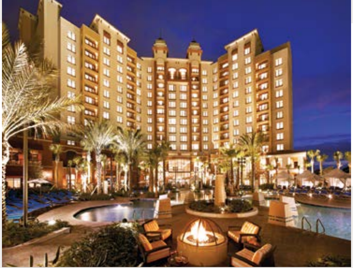
Wyndham Grand Orlando Resort Bonnet Creek.

While Garnes notes that superior function space isn’t a