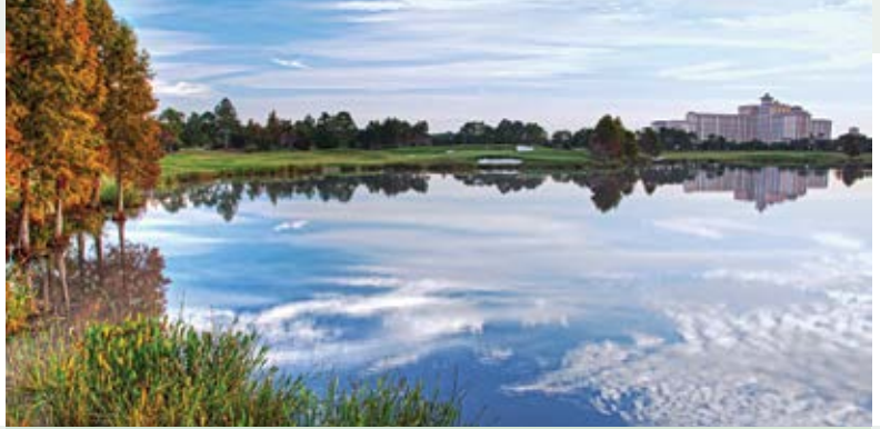
Rosen Shingle Creek.