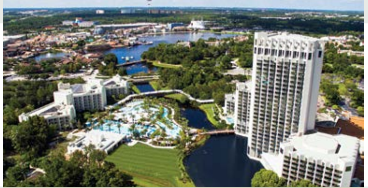
The Hilton Orlando Buena Vista Palace.