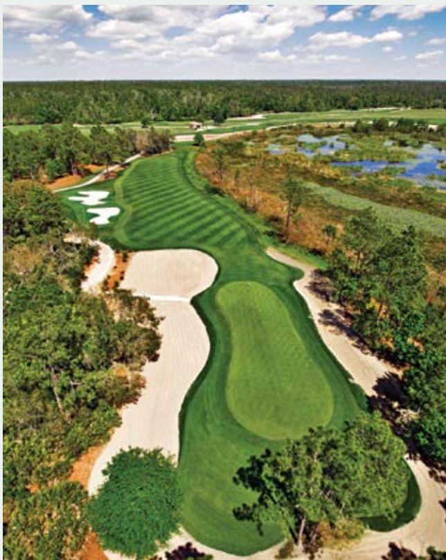
The National at Omni Orlando Resort at ChampionsGate.