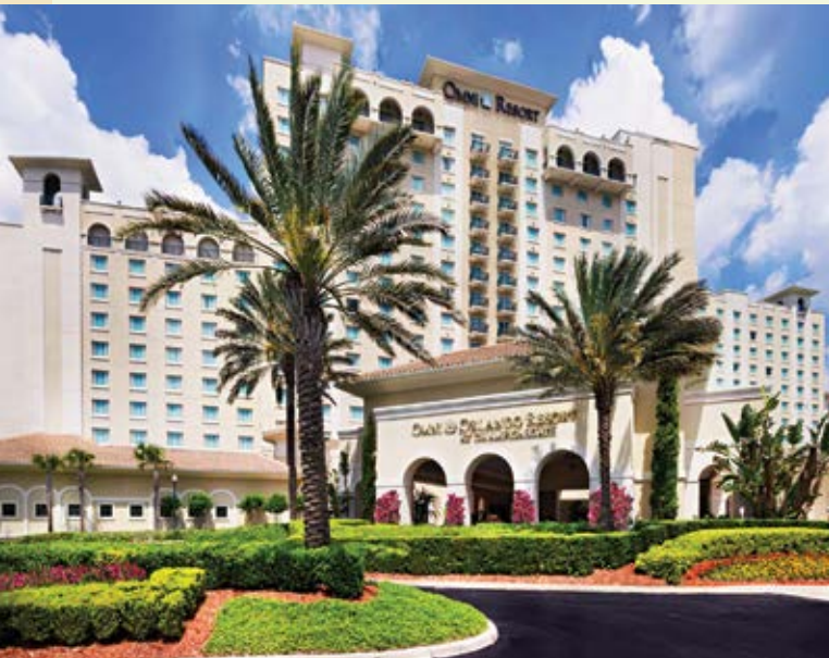
Omni Orlando Resort at ChampionsGate.

Other properties are staying in step with major overhauls. In December, the Starwood-managed Walt Disney World Swan and Dolphin Hotel completed a $5 million renovation of 329,000 sf meeting space, a refresh designed to update carpet and paint along with installing new technology for the convention facilities. The meeting space refurbishments are part of the iconic resort’s multiyear $140 million redesign, which includes an up-