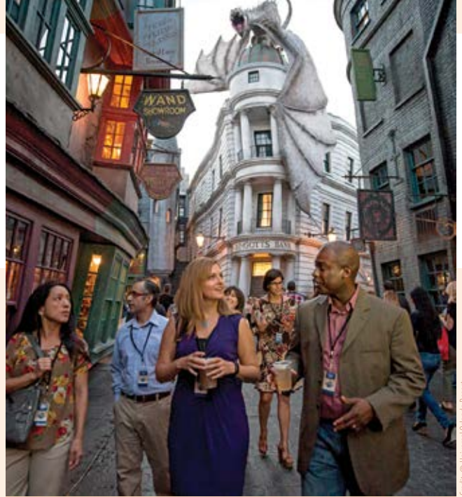
Group events at Universal Studios Florida (l) and The Wizarding World of Harry Potter.

second theme park “gate” Islands of Adventure, the company opened the Wizarding World of Harry Potter. Attendance at the park surged — from an estimated 5.9 million in 2009 to 7.7 million in 2010 (and the Potter attraction was only open the latter half of that year). In July 2014, a Diagon Alley expansion of Wizarding World debuted at the adjacent Universal Studios Florida, and attendance at that theme park spiked again, from an estimated 7.1 million in 2013 to 8.3 million the following year. The cash infusion has no doubt prompted parent company NBCUniversal to reinvest in its busy Orlando operation.