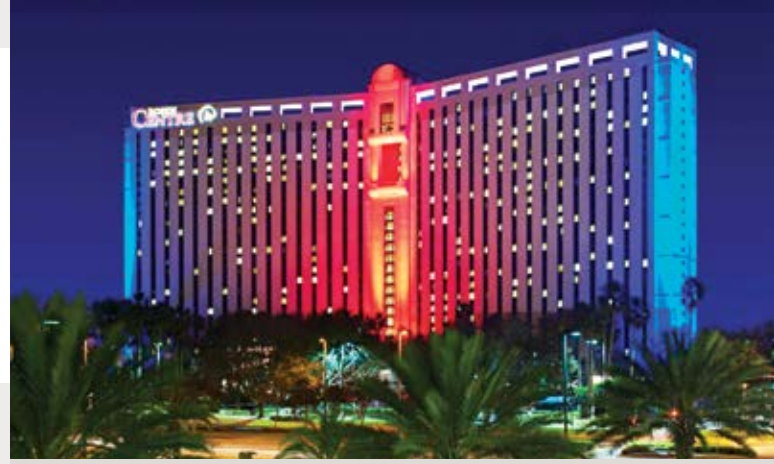
The Rosen Centre Hotel.

three destinations: Disney Springs, Universal CityWalk and Pointe Orlando. This was a way for our guests to experience the area and discover the city. Everybody was very happy with how it turned out for that night."