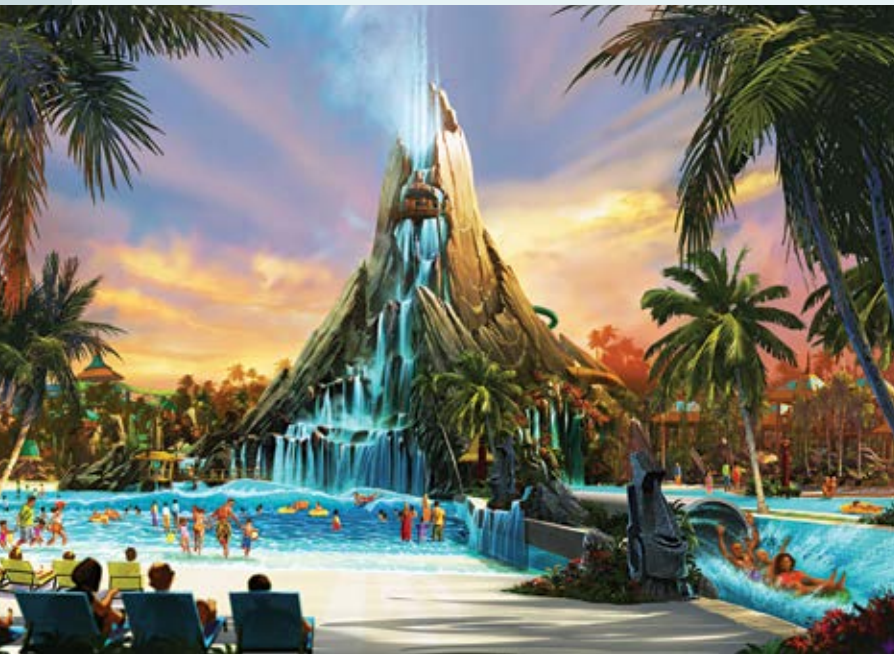
Universal's new water theme park, Volcano Bay, will open May 25.

SeaWorld's second "gate" Discovery Cove offers a nifty alternative to buying out an entire theme park for a private event. It's much smaller, accommodating up to 500 people for evening events, which can be booked year-round. Discovery Cove's typical evening event might be their Luau offer, with covered outdoor seating for up to 250 guests (and total seating of 400) against a backdrop of white sand beaches and dolphin lagoons. Along with the meal, Discovery Cove provides a lei greeting, a Polynesian trio for music, a DJ and a fire-knife dancer. An F&B minimum of $75 per person applies, against a $15,000 guarantee. In winter months, when the park is only open on weekends, the park is available for daytime