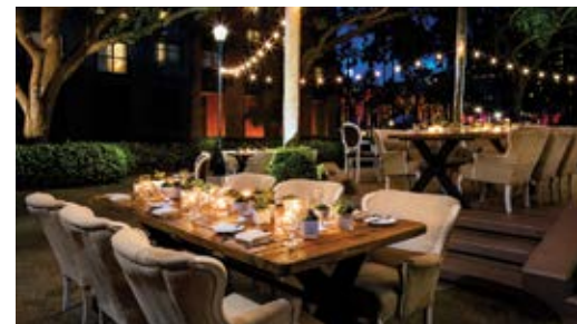
Impressive Meeting Venues