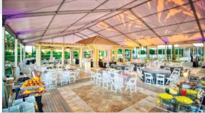
The Waldorf Astoria Orlando.