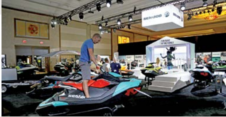
The Bombardier Recreational Products Global Product Reveal Show.