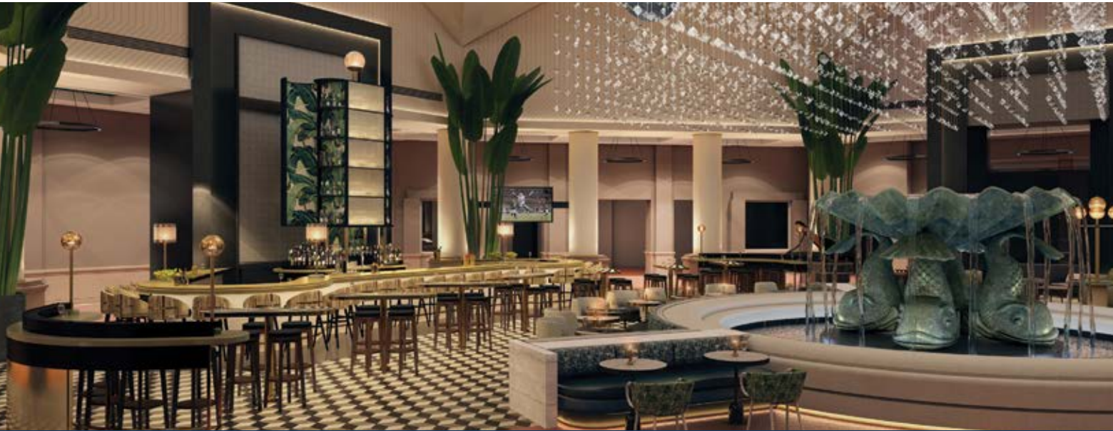
All-New Walt Disney World Dolphin Lobby Concept - Scheduled for completion in September 2017

The Walt Disney World Dolphin lobby will undergo a $12 million re-design, the final stage of a $140 million renovation project, the largest makeover in the resort's history. It will be completely transformed into a sleek, contemporary space featuring new food and beverage options and offer an inviting area for guests to relax or network. A recipient of the prestigious Meetings & Conventions Hall of Fame Award, the Walt Disney World Swan and Dolphin is a nationally respected and recognized leader in the convention resort arena. The resort offers more than 329,000 sq. ft. of meeting space, 84 meeting rooms, and 2,267 guest rooms and suites which feature the Westin Heavenly® Bed. Attendees can also relax in the luxurious Mandara Spa, indulge in one of our 17 world-class restaurants and lounges or enjoy our unique Disney Differences.