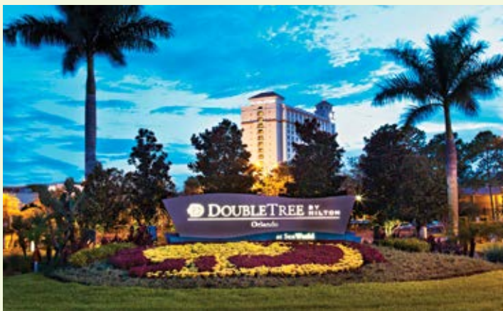
DoubleTree by Hilton Orlando at SeaWorld.