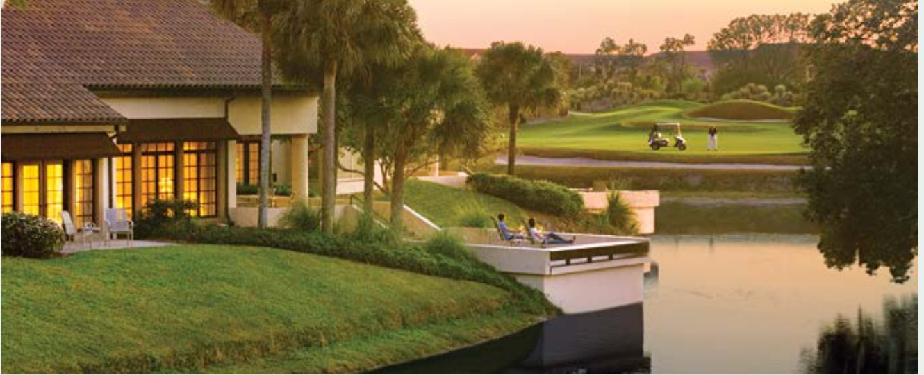
(Top and above) The Grand Cypress Golf Club, which wraps the Villas of Grand Cypress.

the service quality is amazing. We keep on thinking we should go to a new location, but Orlando continues investing in the future for meetings.”