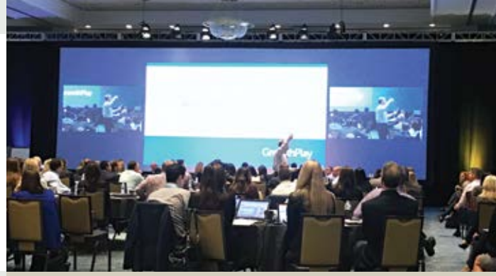
A Kforce meeting at the Hilton Orlando Buena Vista Palace.