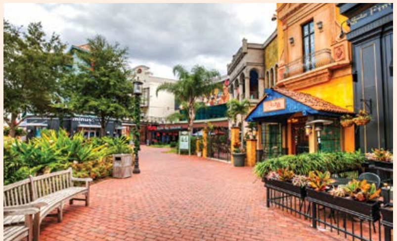
The Pointe Orlando dining and entertainment district.