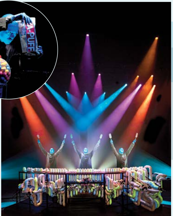
Blue Man Group at Universal Orlando Resort.

lando's bowling/arcade facility covering almost 50,000 sf. State-of-the-art bowling lanes, arcade games, an elevated challenge course and virtual reality pursuits are accompanied by a full bar-and-grill style menu.