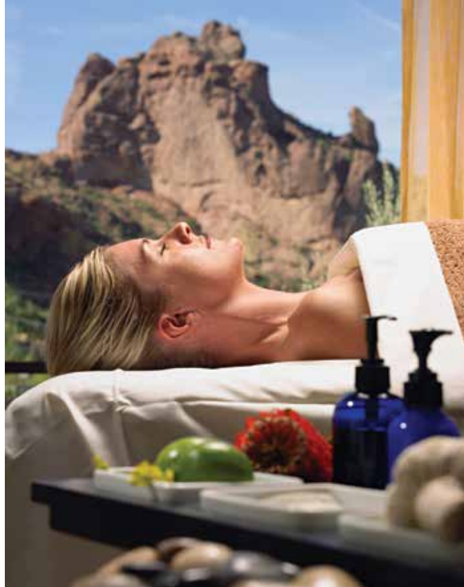
Massage with a view at Sanctuary Camelback Mountain Resort and Spa.

Although the Sonoran Desert may be known for its dry climate, the Gulf of California (Sea of Cortez) and the stingrays that flow through it are critically important and the primary reason the Sonoran Desert has been named the "lushest desert on earth." Visitors are able to create their own moments with these captivating creatures at the Arizona-Sonora Desert Museum's new Stingray Touch experience, which opened last year.