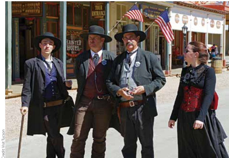
Wild, Wild West street performers in Tombstone.

The Omni Scottsdale Resort & Spa at Montelucia has 293 guest rooms along with more than 27,000 sf of indoor meeting space and 75,000 sf of outdoor space. Conference venues