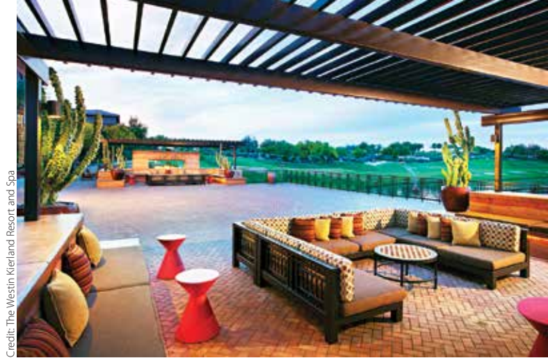
The Northern Sky Terrace at The Westin Kierland Resort and Spa.

Along with 398 guest rooms, the resort features 37,000 sf of