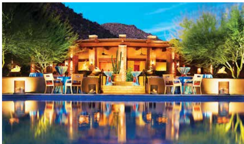
The Ritz-Carlton, Dove Mountain.