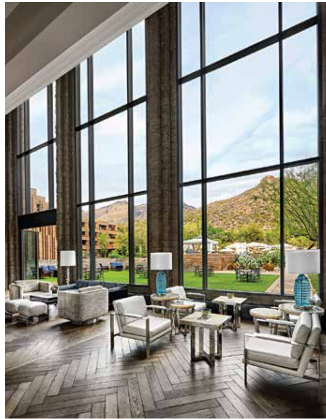
The Tucson Lobby Bar at Loews Ventana Canyon Resort.

The Musical Instrument Museum (MIM) showcases more than 6,500 musical instruments and objects, and music of cultures from around the world and more displayed in MIM's Geographic Galleries using a state-of-the-art guidePORT audio system, along with high-resolution video screens.