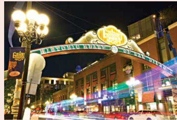
The Gaslamp Quarter in downtown San Diego is a popular dining and entertainment district that also is home to meeting hotels.

The San Diego Tourism Authority has a forecast for your next meeting: “High chance of positive brainstorm, 100 percent chance of budget-friendly solutions, and blue skies and bright ideas.” California’s second largest city boasts a mild Mediterranean climate and more than 70 miles of coastline, and that’s just the beginning. The city spans more than 4,200 square miles, but it is divided into a dozen different neighborhoods, each with its own unique personality. For example, Coronado, located across the bridge from downtown San Diego, is known for its charming small town ambiance, iconic Hotel Del Coronado resort and long stretches of white sand