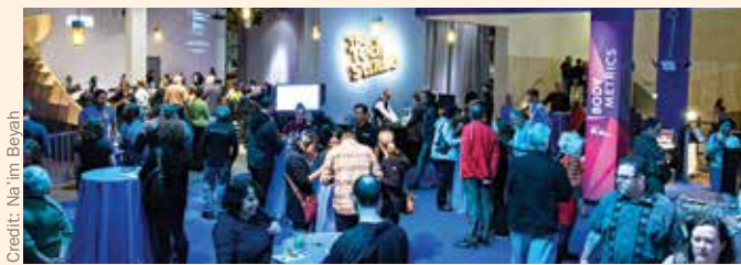
The Tech Museum of Innovation.

ley's spirit of innovation may want to book an event at The Tech Museum of Innovation, a 132,000-sf venue that offers hundreds of exhibits in seven halls on three levels as well as an Imax Dome Theater and a rooftop terrace. The venue, which is within walking distance of the convention center and downtown San Jose hotels, defines itself as "the most inventive place on earth and a showcase of the latest blockbuster exhibits, high-tech gizmos and wondrous gadgets that continue to define Silicon Valley."