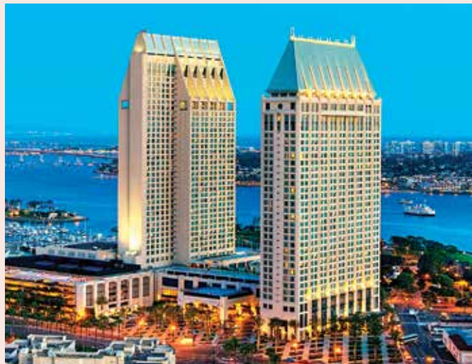
The Manchester Grand Hyatt San Diego overlooks San Diego Bay.

Also located in downtown San Diego, the Manchester Grand Hyatt San Diego is a waterfront hotel located adjacent to the Seaport Village shopping area and less than a 10-minute walk from the San Diego Convention Center. It contains more than 1,600 guest rooms, including 76 suites, 168 Grand Club rooms, 40 accessible rooms and even a pet-friendly floor.