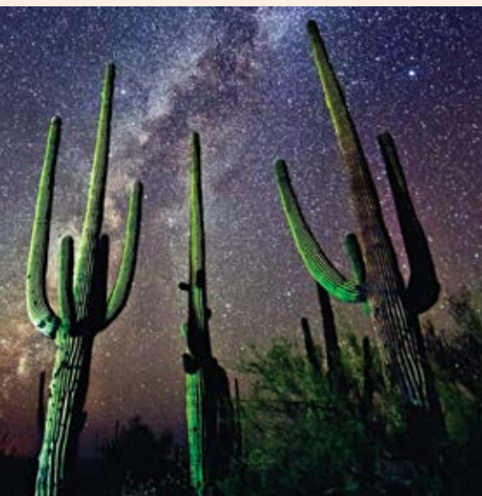
The Ritz-Carlton, Dove Mountain (top) offers a slate of localized activities for groups that want to experience the wonders of the Southwest, including astronomer-guided stargazing.