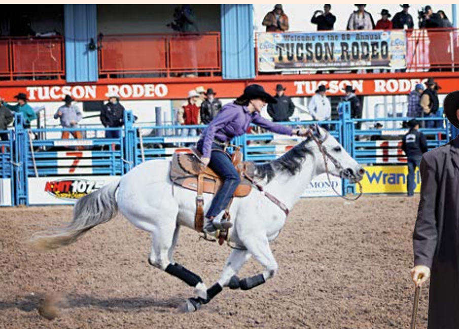
The Fiesta de los Vaqueros Tucson Rodeo, Tombstone street performers and Old Tucson Studios (opposite page) capture the Wild West spirit of Tucson.

Tucson has its own compelling geological drama, surrounded as it is by five mountain ranges. It sits at 2,643 feet above sea level and is one of the sunniest cities in the nation. In addition to miles of paved bike paths, Tucson also has more than 300 miles of mountain biking trails