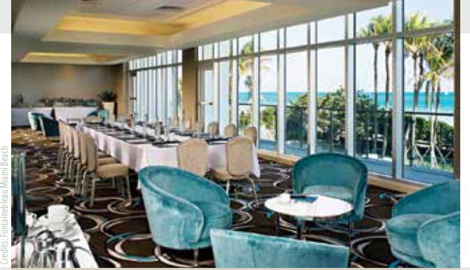
The Fontainebleau features 107,000 sf of indoor meeting and event space.