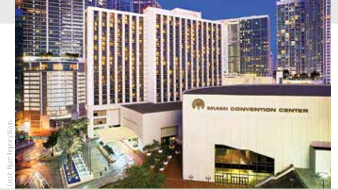
The Hyatt Regency Miami in the heart of downtown is connected to the Miami Convention Center.

Another red-hot new hotel is the 380-room Thompson Miami Beach , located on Collins Avenue just south of the