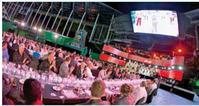
A Bacardi USA event on the field at Marlins Park.