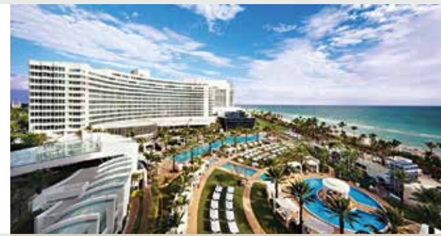
Fontainebleau Miami Beach completed a $1 billion renovation in 2014.