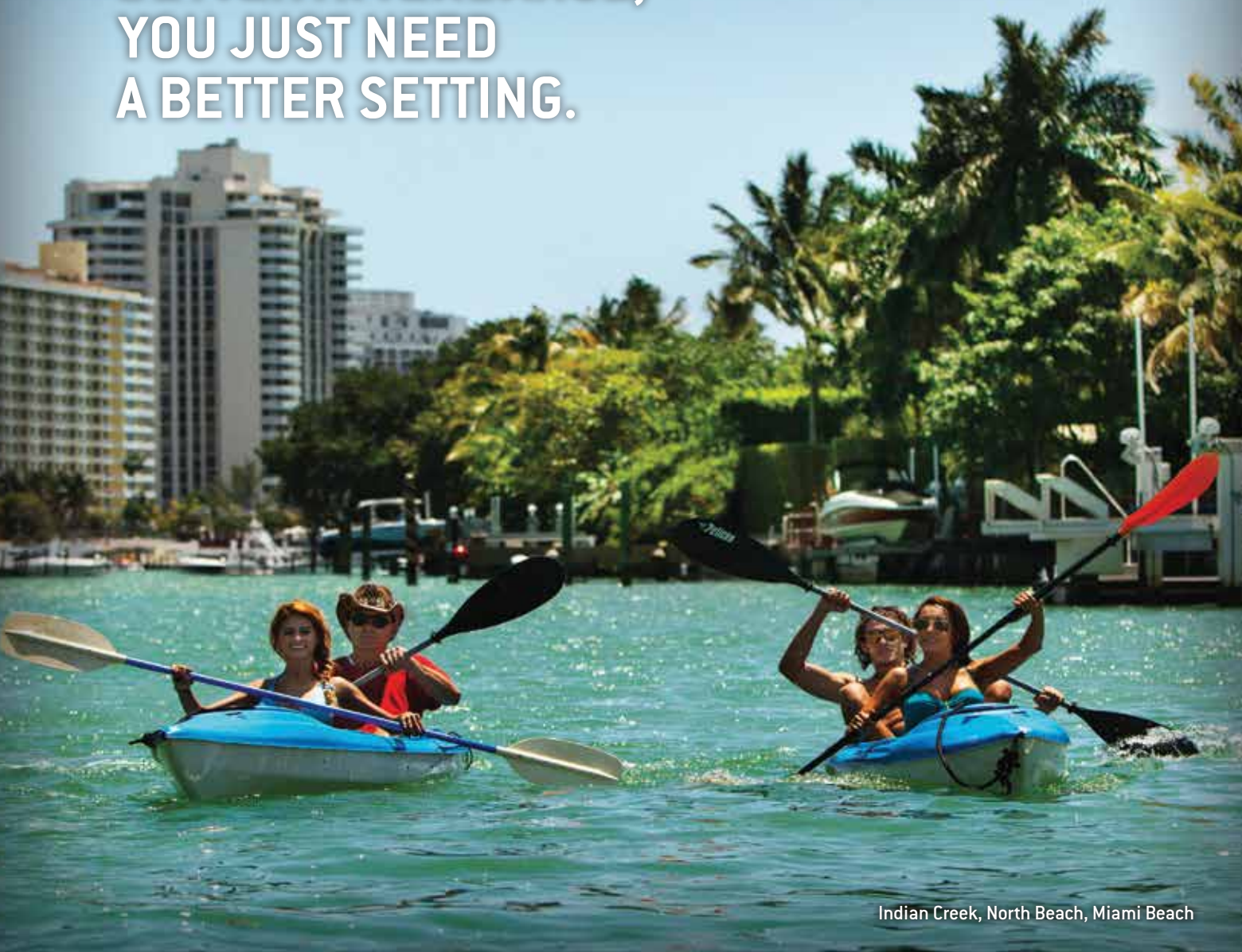
Indian Creek, North Beach, Miami Beach

IF YOU WANT BETTER ATTENDANCE, YOU JUST NEED A BETTER SETTING.