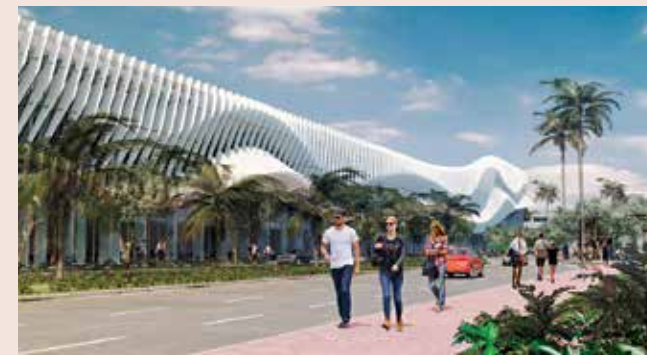
Renderings of the Miami Beach Convention Center expansion.