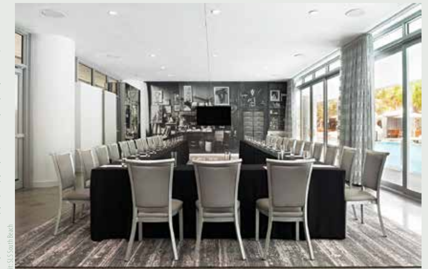
The art deco SLS South Beach features 25,000 sf of flexible Philippe Starck-designed meeting and event space.

Earlier this year, the much-anticipated 1 Hotel South Beach made its debut as the inaugural outpost of the new