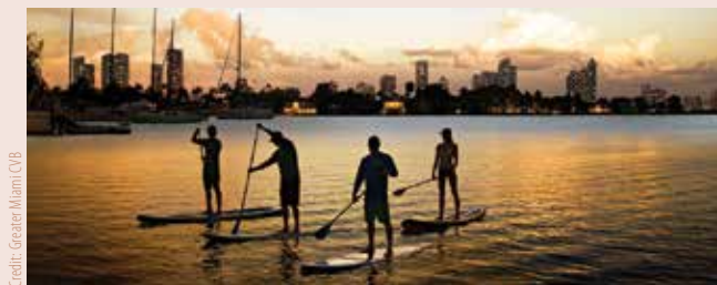
Sunset paddleboarding off South Beach.

And one of the shared reasons people are there is