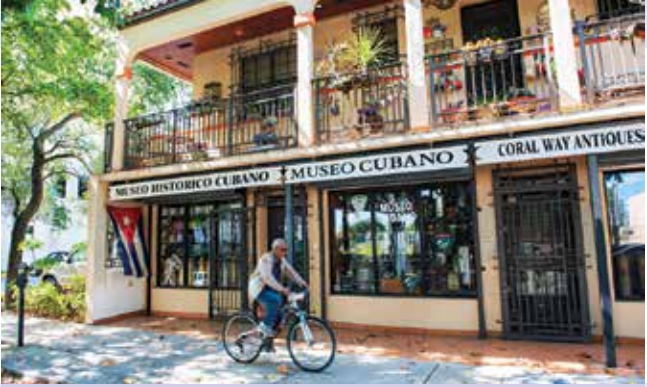
The Cuban Museum and antique shop in Coral Gables.