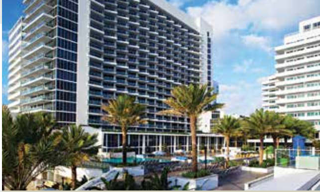
Eden Roc Miami Beach will debut Nobu Hotel at Eden Roc Miami Beach late this year.

Designed by Morris Lapidus, the Eden Roc features architecture that embodies the glitz of a Hollywood stage