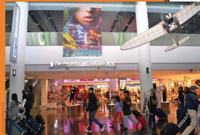
The Shoppes at Ocean Drive at Miami International Airport.