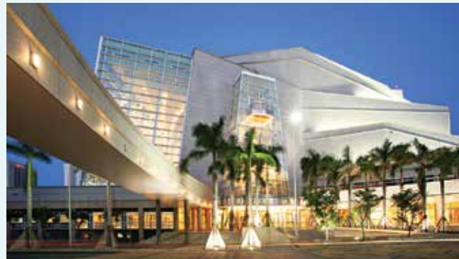
The Adrienne Arsht Center for the Performing Arts.

Anchoring downtown Miami as the premier venue of its kind in Florida is the Adrienne Arsht Center for the Performing Arts , which will celebrate its 10th anniversary next year. Known as the Arsht Center, the facility houses Miami's local symphony, opera and ballet companies, and