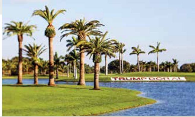
Trump National Doral Miami.