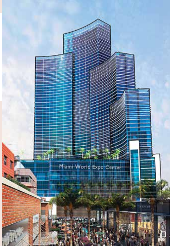
Rendering of the Marriott Marquis Miami Worldcenter Hotel & Expo Center.

The 1.4-million-sf facility will include a 60,000-sf mul-