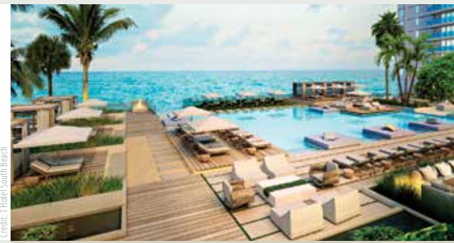
The new 1 Hotel South Beach offers more than 100,000 sf of indoor/outdoor event space.

Another time-honored major meeting property is the 612-room Hyatt Regency Miami , located on the Miami River in the heart of downtown Miami and just 16 minutes from Miami International Airport. The perennially