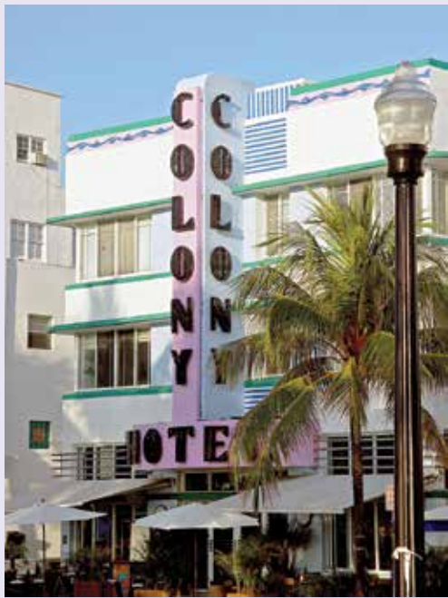
The Colony Hotel, a South Beach art deco landmark.