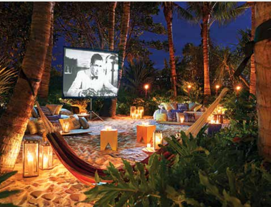
Outdoor movie screening in the "Sandbox" at the new Miami Beach Edition, which opened last fall.