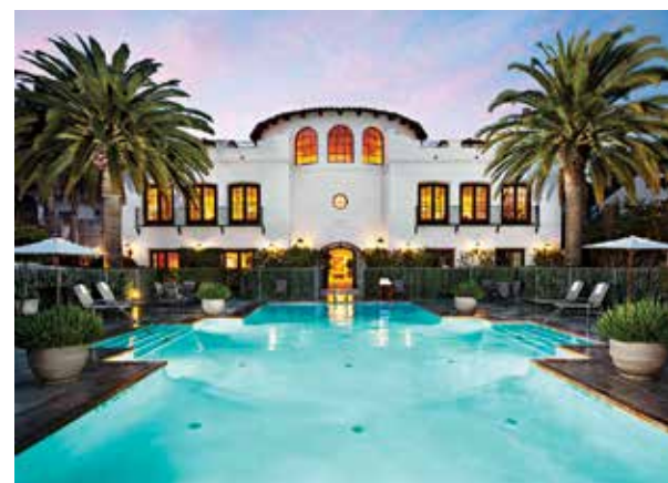
The inviting pool at the award-winning Spa Bacara at the Bacara Resort & Spa, Santa Barbara, California.

At the Blue Harbor Resort & Spa, Sheboygan, Wisconsin, guests choose their favorite scent for the blissful massage to follow at Reflections Spa.