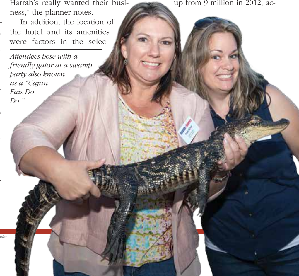
Attendees pose with a friendly gator at a swamp party also known as a “Cajun Fais Do Do.”

The accounting company’s attendees are among a growing number of visitors to New Orleans. The city welcomed 9.2 million visitors in 2013, up from 9 million in 2012, ac-