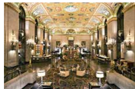
The lobby of the Palmer House Hilton.

CHICAGO, IL — Downtown Chicago’s historic Palmer House Hilton celebrated 143 years with the unveiling of its $215 million renovation. The 1,641-room hotel has undergone an extensive restoration of its executive level, hospitality suites, meetings facilities, health club, business center and restaurants.