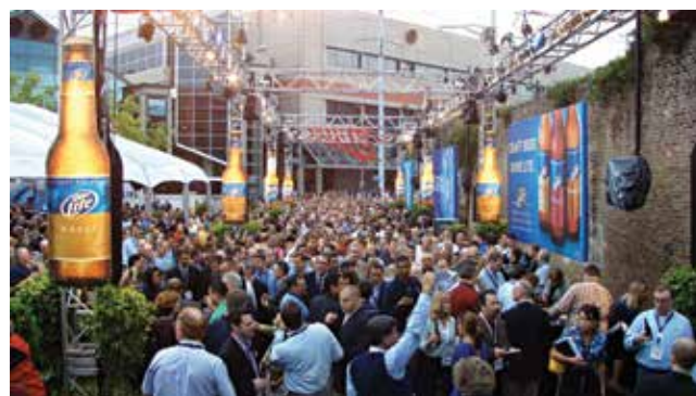
The Sugar Mill, located directly across from the convention center near the Mississippi River, can accommodate more than 3,000 attendees for large corporate events.

Major projects will be funded partly by a new Tourism Support assessment. In February, the members of the Greater New Orleans Hotel and Lodging Association voted to pass the assessment of 1.75 percent of the daily room charge, effective April 1, 2014. The assessment was passed to “fund the vital sales, marketing, promotion, incentives, visitor management and special event activities that keep New