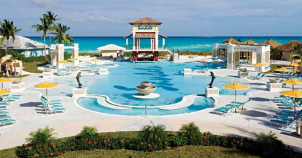
Post spa treatments at the Red Lane Spa, attendees can relax and enjoy the inviting pool at Sandals Emerald Bay, Great Exuma, Bahamas.

and Spa is taking its new spa in an eco-luxury direction with “greenovation.” For its redesign, the spa has incorporated repurposed and upcycled elements such as reclaimed wood art installations and mosaic glass lighting sconces to create a holistic health environment that brings the outdoors into the spa in a way designed to make guests feel connected to nature yet pampered at the same time. The “Do Organic, Be Organic, and Live Organic” program offers guests an option to have a completely natural experience from treatments to cuisine.