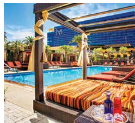
A visit to Spa Mio can be followed by a dip in the pool at the DayDream pool club at the M Resort Spa Casino in Las Vegas.

SRI International’s 2013 Global Wellness Tourism Economy report