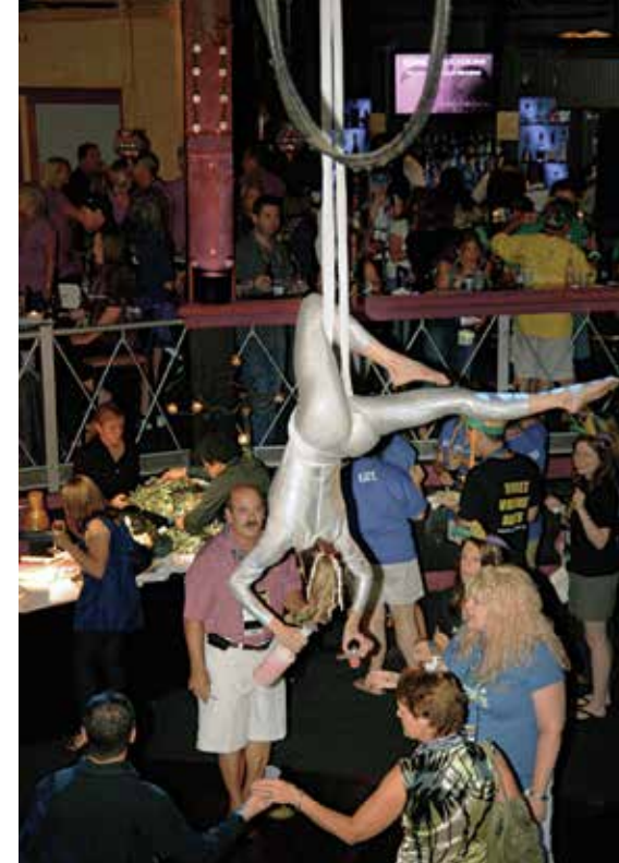
An aerialist pours cocktails for attendees during a reception at the popular venue Generations Hall.

The accounting firm’s meeting planner only booked one company activity because the group preferred to explore New Orleans on their own, including a trip to the Fair Grounds Race Course to watch the horse races. “Other than that, they were pretty much on their own. They loved that because in New Orleans, they could walk almost anywhere they wanted to go. Everything is so accessible. There’s the world-class dining, the historical area and there’s always Bourbon Street.”