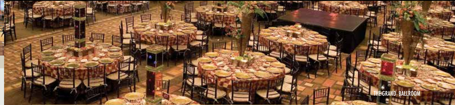
THE GRAND BALLROOM

Luxurious and Comfortable Accommodations in our AAA Four Diamond Hotel and Casino