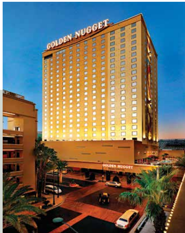
The Golden Nugget, downtown Las Vegas.

Also on the downtown agenda is the renewal of the