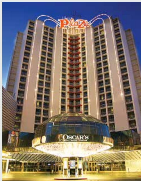
Plaza Hotel & Casino, downtown Las Vegas.

Recently, South Point, the United States Bowling Congress (USBC), Las Vegas Events (LVE), and the LVCVA announced a 12-year deal to host several annual USBC events, both citywide and inside a new, $30 million bowling tournament facility with more than 60 lanes at South Point, which is expected to be completed by fall 2015. The property's