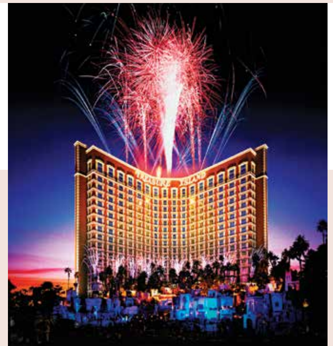
Treasure Island — TI Hotel & Casino.

Last year, Ralenkotter notes proudly, Las Vegas hosted nearly 22,000 meetings that drew 4.9 million attendees and generated $6.7 billion in revenue for the local economy, which supports nearly 57,000 hospitality industry jobs.