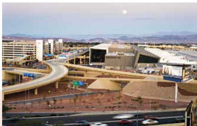
McCarran International Airport's new Terminal 3.

Aside from being exciting for attendees, however, Las Vegas delivers a long and comprehensive list of practical benefits for planners.