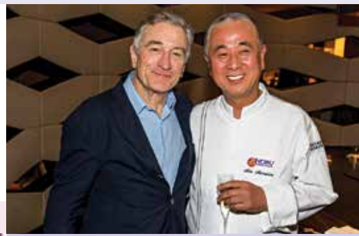
Robert De Niro and Chef Nobu Matsuhisa.