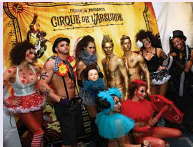
Cirque du Soleil performed at NAB's Fusion-io party.