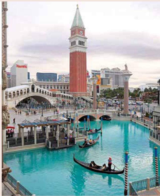
Gondolas at The Venetian Resort Hotel Casino.

a very compact stretch of real estate," he says, "so it's also a very convenient destination in terms of logistics. In that