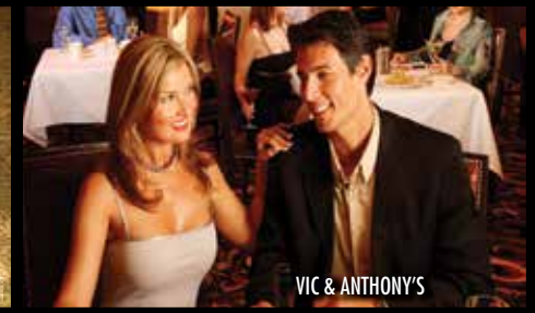
VIC & ANTHONY'S