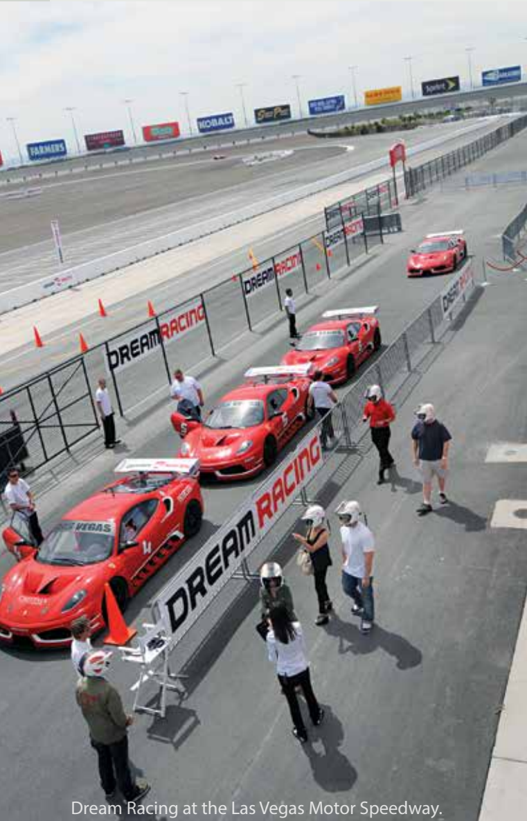
Dream Racing at the Las Vegas Motor Speedway.

the Las Vegas Philharmonic, is available for events, too. And the impressive Keep Memory Alive Event Center at the Frank Gehry-designed Cleveland Clinic Lou Ruvo Center for Brain Health is a popular event space for up to a 700-person reception.