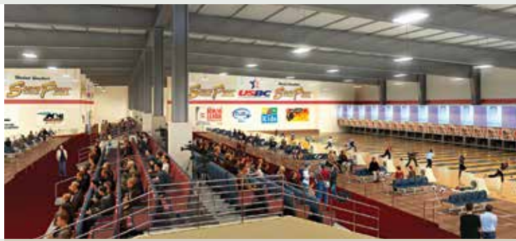
Rendering of the new tournament bowling facility at South Point.