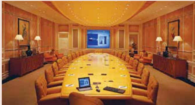
The Executive Board Room at MGM Mirage.

Currently offering more than 60,000 sf of meeting and exhibition space, the conference center at Tropicana Las Vegas can accommodate large events for up to 3,000 delegates. The hotel will build five 650-sf breakout rooms on the second floor of the Club Tower, adding to its three ballrooms, which comprise 19 breakout rooms in the conference center. All of the new breakout rooms will have private restrooms and the warmth of natural light.