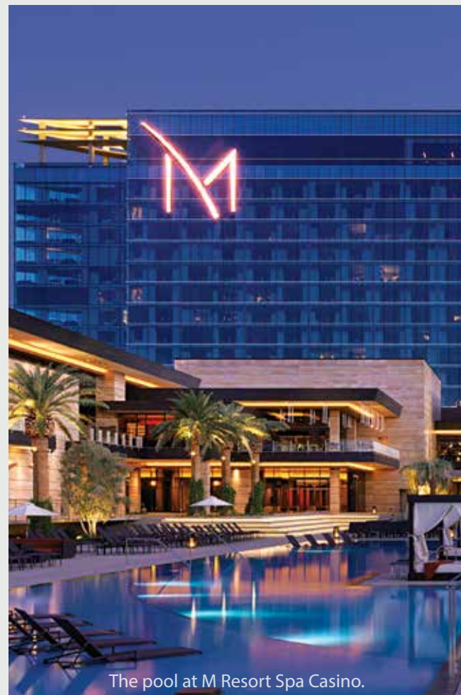
The pool at M Resort Spa Casino.

Already receiving rave reviews, the new $485 million Smith Center for the Performing Arts, which is home to