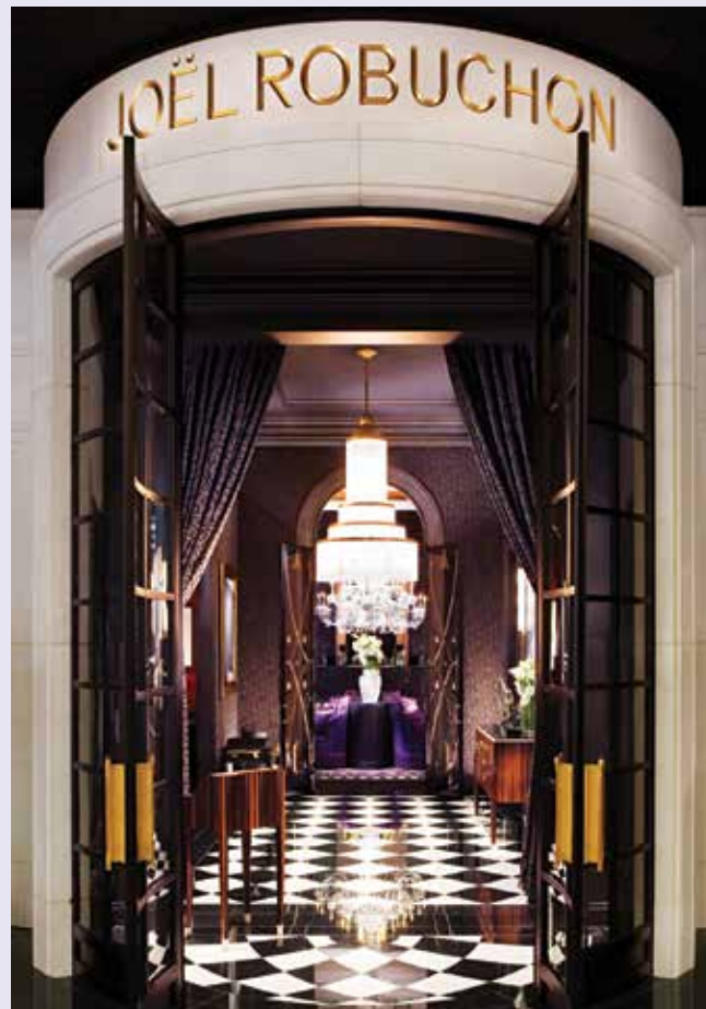
Restaurant Joël Robuchon at MGM Grand.

Nobu Matsuhisa, the king of sushi and progressive Japanese cuisine, operates Nobu Las Vegas in the Hard Rock Hotel & Casino and in April opened the world's largest Nobu Restaurant and Lounge in Caesars Palace. The 11,200-sf Nobu restaurant and lounge, located in the heart of the new Nobu Hotel, offers several teppanyaki tables,