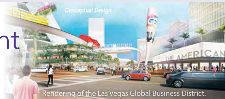
Rendering of the Las Vegas Global Business District.