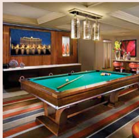
A new Executive Parlor Suite at Bellagio.