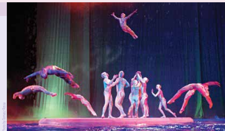
"O" by Cirque du Soleil at Bellagio.

And for more budget-conscious planners still looing for something new and name-driven, there is Gordon Ramsay's BurGR, which brings a master chef's touch to