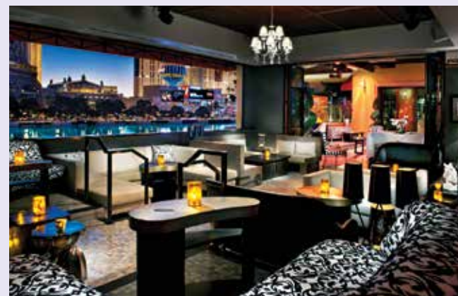
The North Terrace at Hyde Bellagio.

Hyde Bellagio, the fountain-side lounge, transforms into one of the city's hottest spots after dark featuring established and up-and-coming DJs. LV