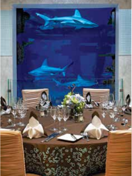
The new Seascape Ballroom at Mandalay Bay's Shark Reef Aquarium.

Early next year, Gansevoort Hotel Group and developer