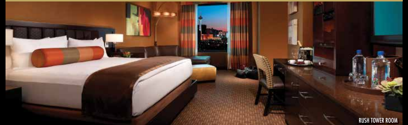
RUSH TOWER ROOM

Located on the World Famous Fremont Street Experience Boasting Free Nightly Entertainment in the Heart of Downtown