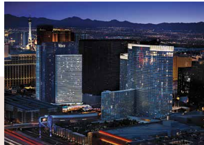
CityCenter's Vdara Hotel & Spa and Aria Resort & Casino.