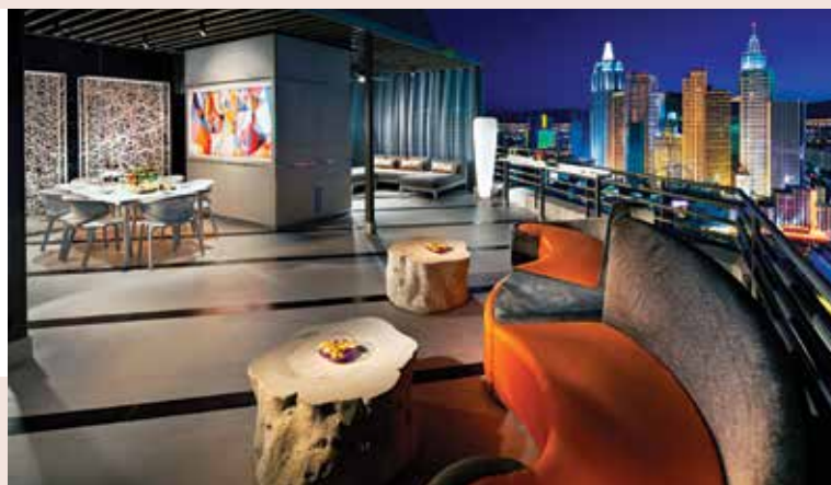
The balcony at MGM Grand's new Skyline Terrace Suite.

In early June, MGM Resorts International, which operates a portfolio of some of the city's most acclaimed