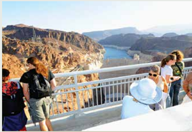
The Memorial Bridge overlooking Hoover Dam.