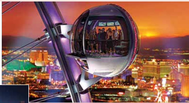
Renderings of Caesars Entertainment's new Linq district and a High Roller cabin.