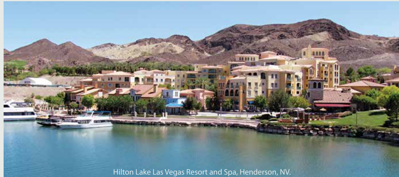
Hilton Lake Las Vegas Resort and Spa, Henderson, NV.

different options at a range of prices. So between The Strip and off-Strip properties, and places like Lake Las Vegas and Henderson, you can always find a good fit for a meeting in Vegas, no matter the size or budget."