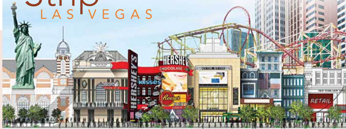
A rendering of MGM Resorts International's new plaza connecting New York-New York and Monte Carlo.

Mandalay Bay's 1.3-million-gallon Shark Reef Aquarium. The newly opened Seascape Ballroom was designed to highlight the 30 sharks and other aquatic creatures that make their home in the aquarium. An adjoining outdoor patio and lounge, with a pergola for ambience and privacy, allows for flexible use of the space. The 1,675-sf ballroom accommodates up to 125 guests for receptions and up to 80 guests for a seated event. Guided tours of the aquarium for groups also are available.