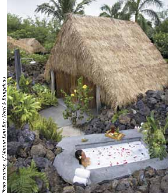
The Mauna Lani spa resembles a Hawaiian village with grass-thatched houses for treatments, two natural lava saunas, a meditation pavilion and a Watsu pool.

Aloha is more than just a greeting in the Hawaiian culture. Aloha