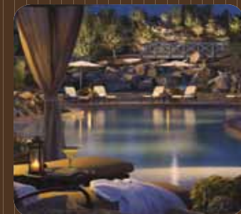
Omni Denver Interlocken Resort