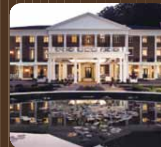
Omni Bedford Springs Resort