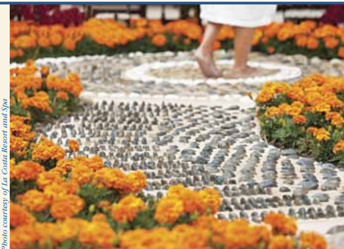
One of only a few reflexology paths in the U.S., this one at The Spa at La Costa stimulates pressure points in the feet, which improves energy, relieves stress, improves balance and more.

Providing all these benefits of reflexology, a walking path affords all the additional health benefits of the fresh outdoor air, beauty of nature and control over the amount