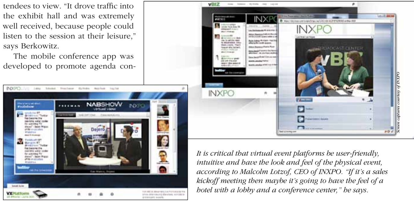
It is critical that virtual event platforms be user-friendly, intuitive and have the look and feel of the physical event, according to Malcolm Lotzof, CEO of INXPO. “If it’s a sales kickoff meeting then maybe it’s going to have the feel of a hotel with a lobby and a conference center,” he says.

The satellite and Web broadcasts, on the other hand, resulted in a centralization of the messaging source. And going hybrid itself illustrated a key message to the salesforce. “Right now we’re asking them to evolve their agencies into hybrid agencies, meaning that they need to