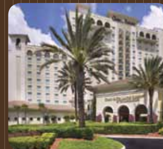
Omni Orlando Resort at ChampionsGate