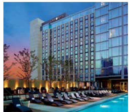
Omni Nashville Hotel