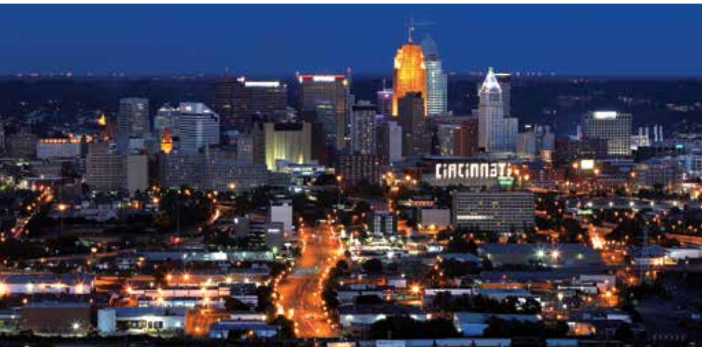
Cincinnati USA's Vibe Cincinnati program targets multicultural SMERF groups.

It’s also important to remember the following when negotiating concessions: “Each property knows the dollar value of your wish list,” Jones says. “Some are easy to provide, some may be impossible with a hefty price tag.