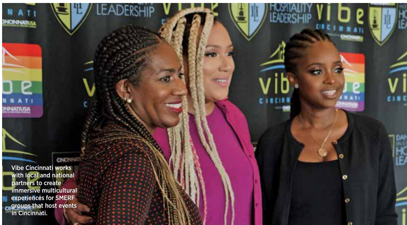
Vibe Cincinnati works with local and national partners to create immersive multicultural experiences for SMERF groups that host events in Cincinnati.