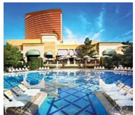
Wynn Las Vegas

You will find profiles of several of the best of the best on the following pages. | AC&F |