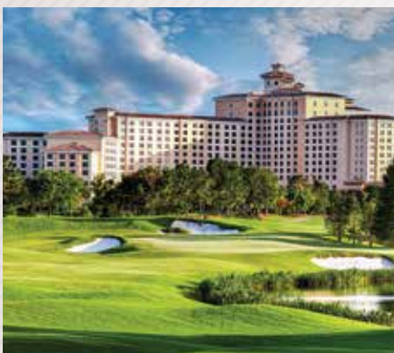
Rosen Shingle Creek