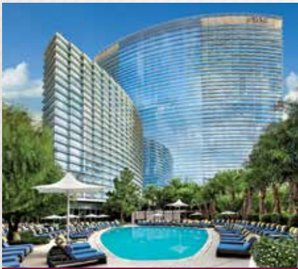
ARIA Resort & Casino

T he deserving winners of the 2019 Distinctive Achievement Awards presented by Association Conventions & Facilities magazine have met or exceeded the high standards that association meeting planners demand today. Many of the more than 20,500 meeting professionals who read Association Conventions & Facilities cast their ballot for the hotels, resorts and convention and visitors bureaus that successfully accommodated their association meetings during the past year.