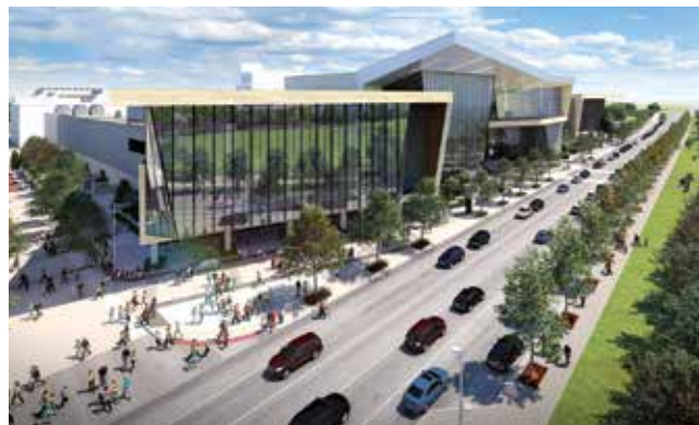
exhibit hall will dominate the ground floor, featuring three operable walls to divide it in up to four flexible spaces. About 45,000 sf of meeting spaces are on all levels of the building, and many also have operable walls to make the spaces flexible. The rooms can be configured to provide up to 27 individual meeting spaces. A 30,000-sf ballroom is the main space on the fourth level, complemented by 10,000 sf of pre-function space and a 4,000-sf balcony.

OKLAHOMA CITY, OK — The MAPS 3 Convention Center was ceremonially “topped out” in August, an important milestone on the way to its scheduled opening in late 2020. “Topping out,” traditionally traced to Scandinavia, is a ceremony in tribute to the natural resources used to construct a building. A tree or branch is placed on the highest beam in the frame, often with flags or streamers. For the MAPS 3 Convention Center, crews secured a tree with an American flag. The 200,000-sf