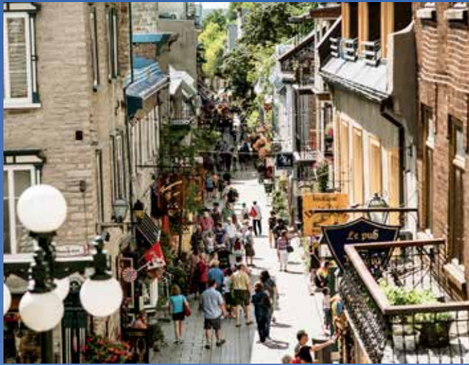
Quartier Petit Champlain