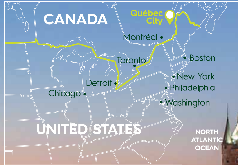
Québec, accessible via major U.S. cities

- Global Sports Impact Index (GSI Canada, 2019)