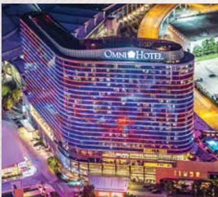
Omni Dallas Hotel